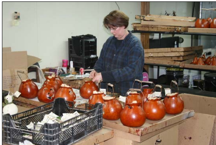
Meadowbrooke Gourds in Carlisle, Penn., gives tours of its high-end decorated gourd factory.

sales in the shop or winery that are). Farm tours tend to be seasonal: summers generally attract vacationing families; spring and fall are less crowded and tend to attract seniors. Strategies might include working with the motor coach industry to bring in bus tours, and marketing the educational aspects of the farm or factory to the local school district in order to bring school children for educational programs. Specialty crop and local heritage groups could work with farmers and processors to establish tours and tasting rooms similar to what wineries have been doing for years. Food manufacturing companies large and small all over the United States open their doors to consumers who want to learn about where their food comes from. Liability and cost issues must be taken into